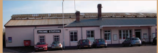
Frome station today

The original wooden train shed is a rare survivor, and the last one in Britain through which trains still pass.