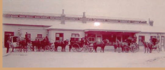
Frome Station in 1900

First opened in 1850, this is one of the oldest functioning railway stations in Britain.